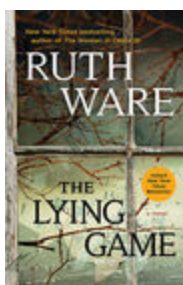
The Lying Game