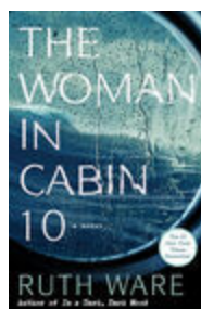
The Woman in Cabin 10