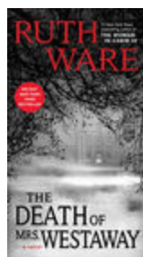
The Death of Mrs. Westaway