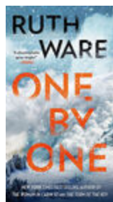
One by One